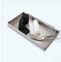
Stainless steel material tray